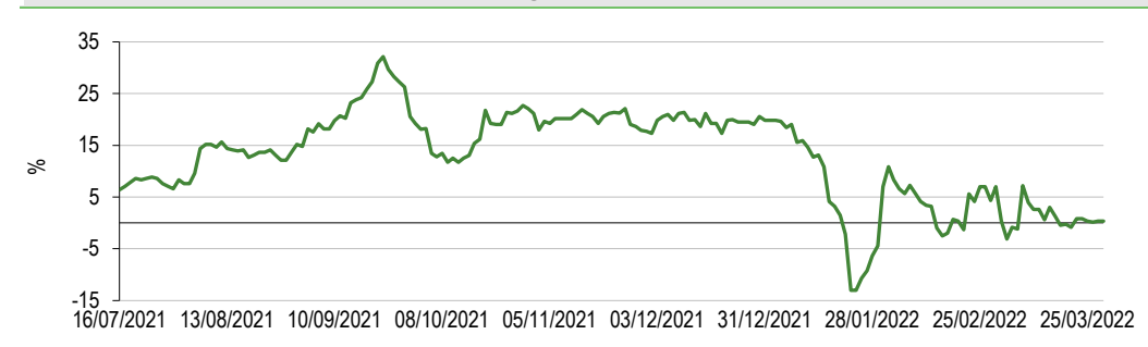
Exhibit 7: Volatile premium/discount range since launch

Since launch SSIT's share price has traded largely at a premium to its cum-income NAV, despite the high level of undrawn cash within the fund. More recently the share price sold off in sympathy with the general tech correction seen in the wider market, although, with some recovery, it now trades at around NAV.