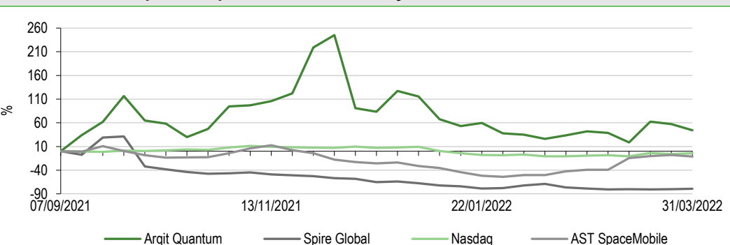
Exhibit 8: Quoted portfolio performance since July 2021

duration assets saw a significant correction as the market rotated away from growth to value primarily due to inflation and interest rate expectations. The majority of the portfolio is unquoted, but it is worth referencing the share price movements of the three quoted holdings Arqit Quantum, Spire Global and AST Space Mobile, which at December 2021 accounted for around 23.7% of NAV. While Arqit's value increased from £36.1m to £47.9m, SSIT's holdings in Spire Global and AST fell in value over the quarter from £11.9m to £5.5m.